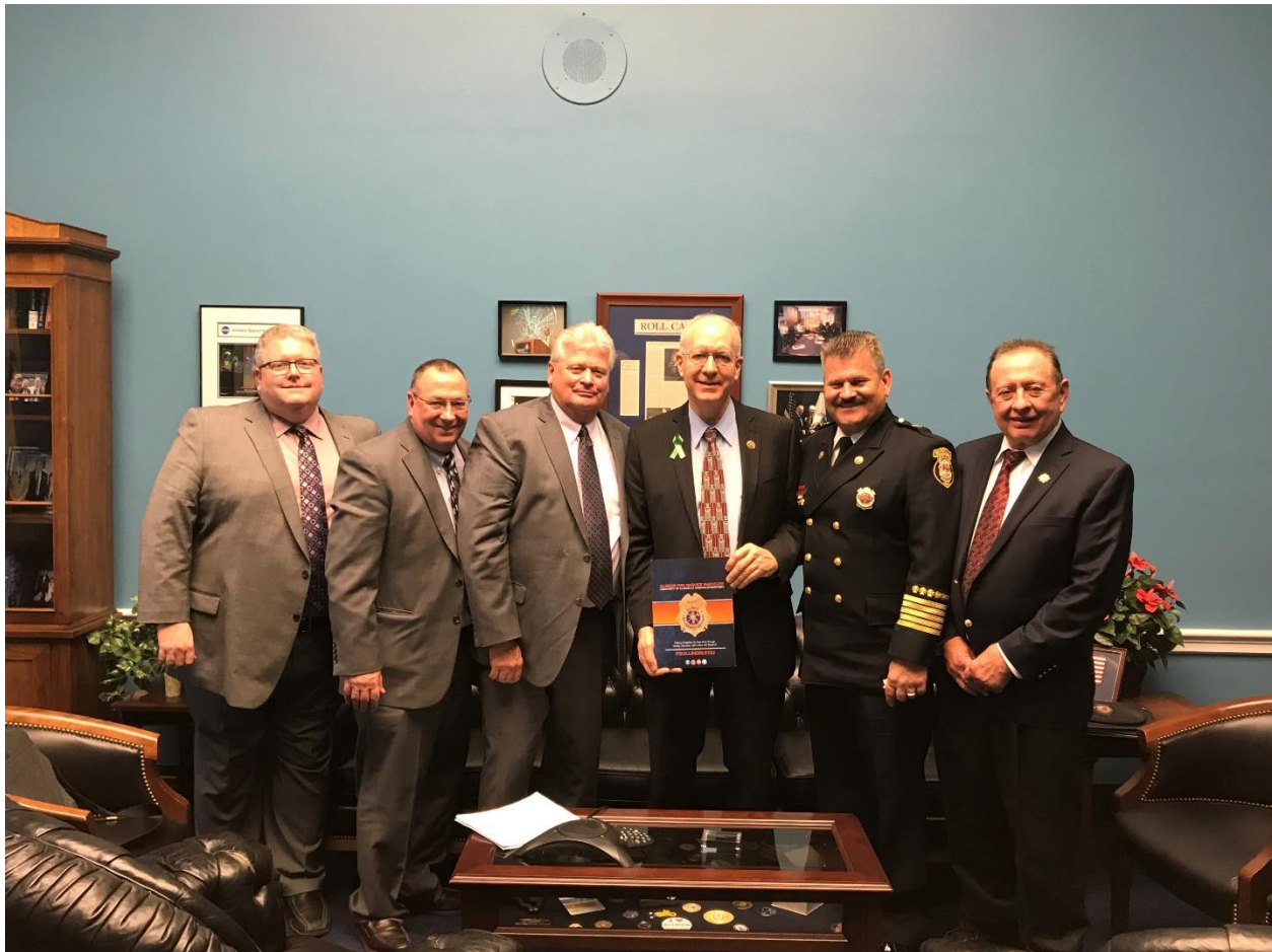
IL Fire Service Meeting with Congressman Bill Foster

As many of you know the IL Fire Service Institute is the oldest fire institute in the country, they trained over 65,000 firefighter and fire personnel in 2018 from 100 of the 102 counties in Illinois. They also trained firefighters from 38 other states along with 7 other countries. The IL Fire Service Institute is recognized as one of the best fire training facilities in the United States. It provides a major economic impact for the city of Champaign and to the State of Illinois.